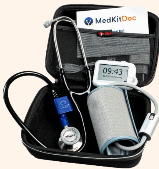
Certified Medical Devices